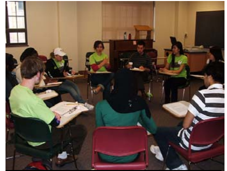
Students attending a workshop during the Harambee Conference.

These three diverse speakers equipped students with valuable tools that can be used to begin enacting change . Everyone can reach beyond the parameters of St. Olaf and start working on changing the world.