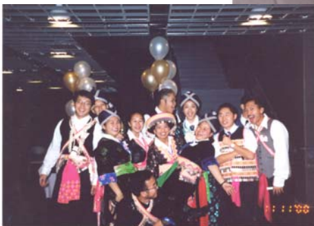
HCO members dressed up and excited at the 2000 Hmong New Year.